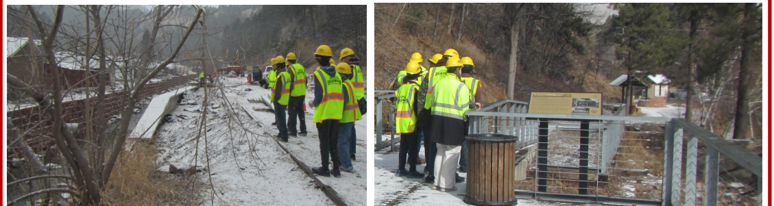
Pictured above: Students tour the FEMA worksite along Whitewood Creek. They learned about the damage that was caused by flooding in 2019 and how FEMA is paying for repairs and improvements to the creek and surrounding areas.

Students from Lead-Deadwood High School spent the day working alongside government employees in Lead, Deadwood and Lawrence County offices. The annual event, sponsored by the American Legion, provides the students with the chance to learn from city and county leaders and to see some of the less glamorous roles public employees must fill as they go about their daily functions. Students were able to tour the ongoing FEMA project along Whitewood Creek, spend time with members of the Deadwood Volunteer Fire Department, as well as the various departments within the City of Deadwood, such as Parks, Streets, Water, Rec Center, Public Works, Archives, and Police Department. Students enjoyed lunch with City Staff and then attended the City Commission meeting.